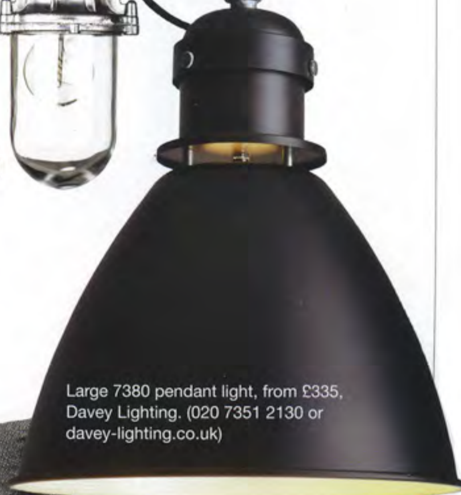
Large 7380 pendant light, from £335, Davey Lighting. (020 7351 2130 or davey-lighting.co.uk)