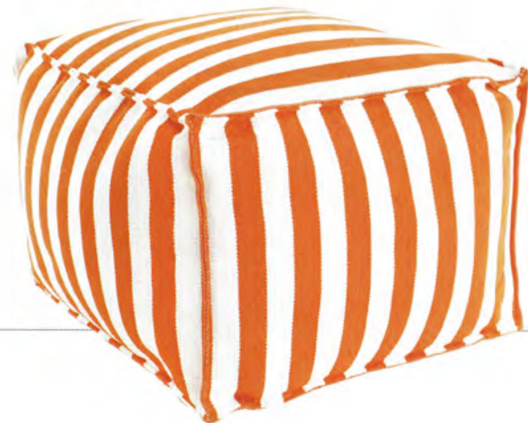
Below: Trimaran stripe tangerine pouffe, £292, Dash & Albert Europe. (+34 91432208 or dashandalberteurope.com)