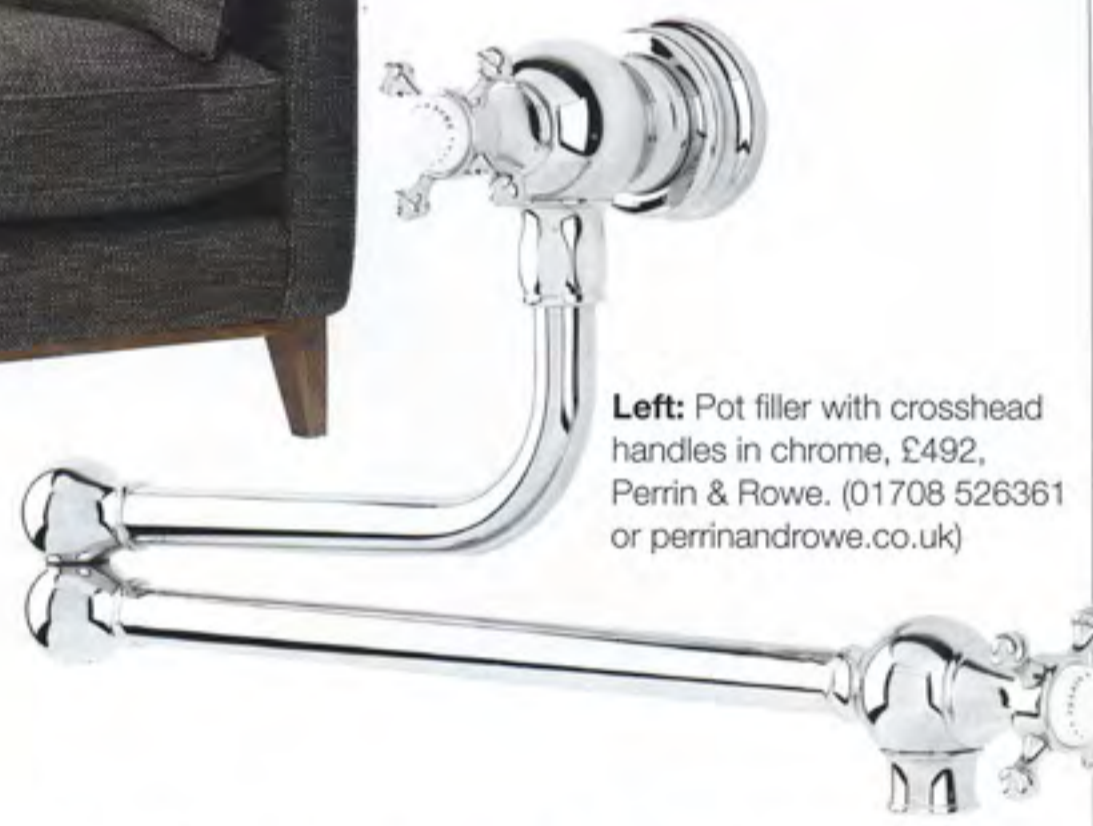
Left: Pot filler with crosshead handles in chrome, £492, Perrin & Rowe. (01708 526361 or perrinandrowe.co.uk)