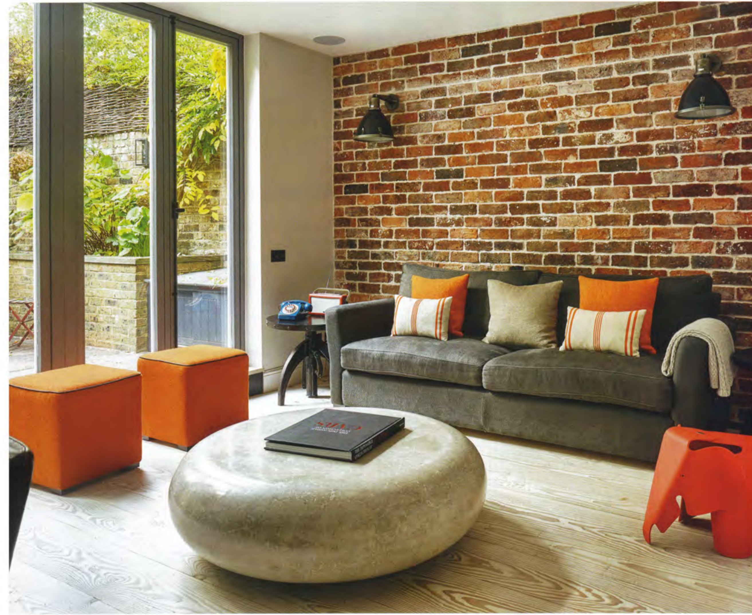
Above: Finished in tinted and polished plasters, the Coffee Bean coffee table is furnished with castors so it can easily be moved around to make room for the children to play. Bright pops of colour enliven the space's natural shades.