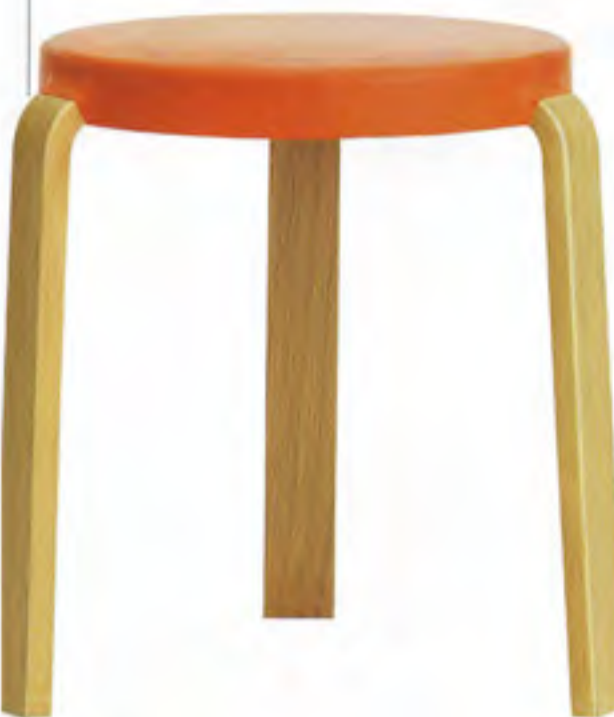
Left: Normann Copenhagen Tap stool, £136, Black by Design. (01889 502716 or black-by-design.co.uk)