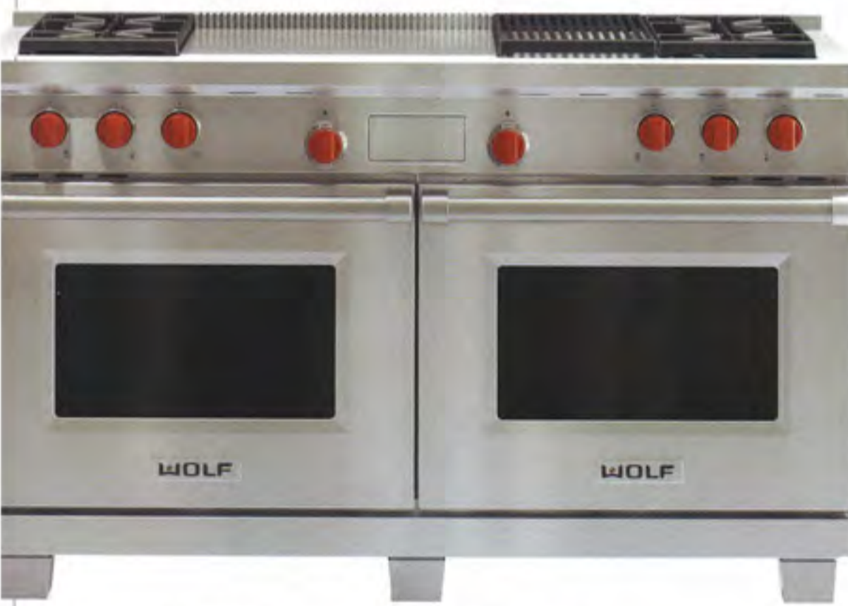
Above: ICBDF604CF range cooker, £23,400, Wolf. (0845 250 0010 or subzero-wolf.co.uk)