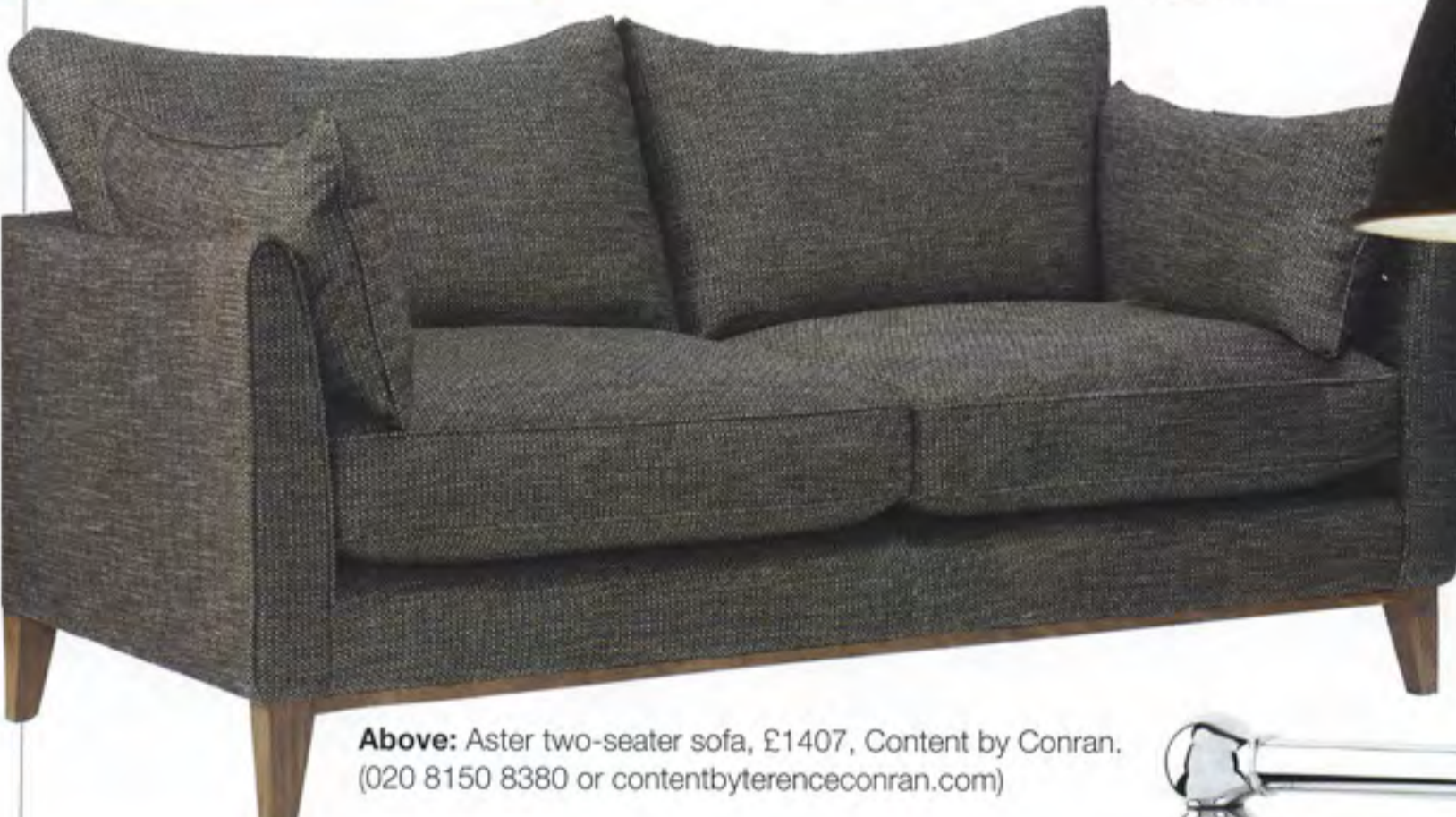
Above: Aster two-seater sofa, £1407, Content by Conran. (020 8150 8380 or contentbyterenceconran.com)